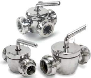
2/3 Way Plug Valve