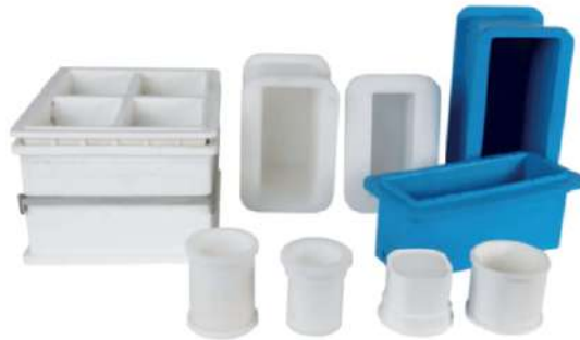
Micro Perforated Moulds