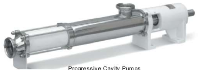
Progressive Cavity Pumps