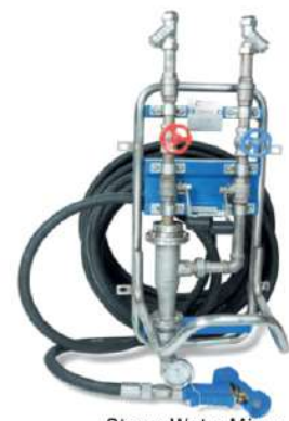
Steam Water Mixer