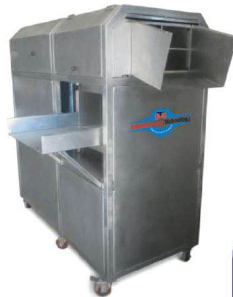
Butter Block Cutting Machine