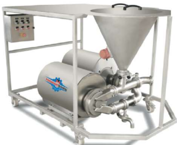
Solid Liquid Blander