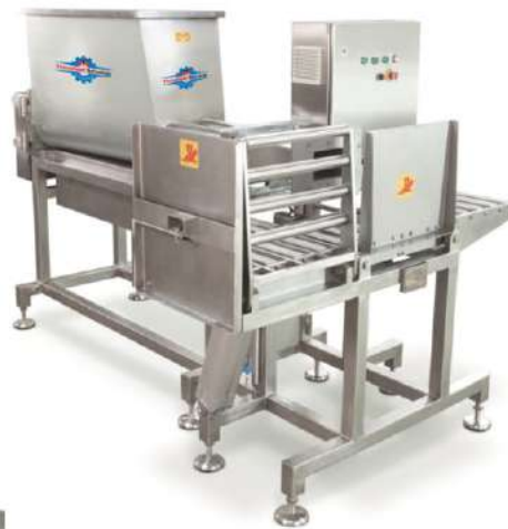
Bulk Butter Filling Machine