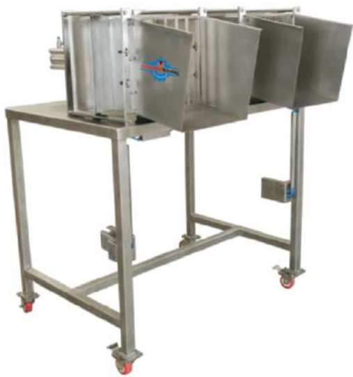
Paneer Dicing/Slicing Machine