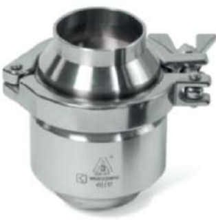
Non Return Valve