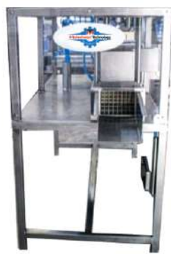
Paneer Cutting Machine