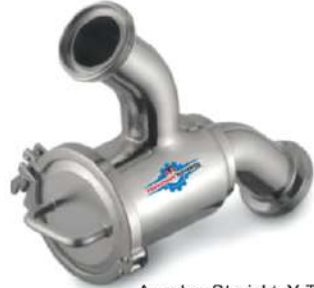
Angular, Straight, Y Type & Duplex Filters