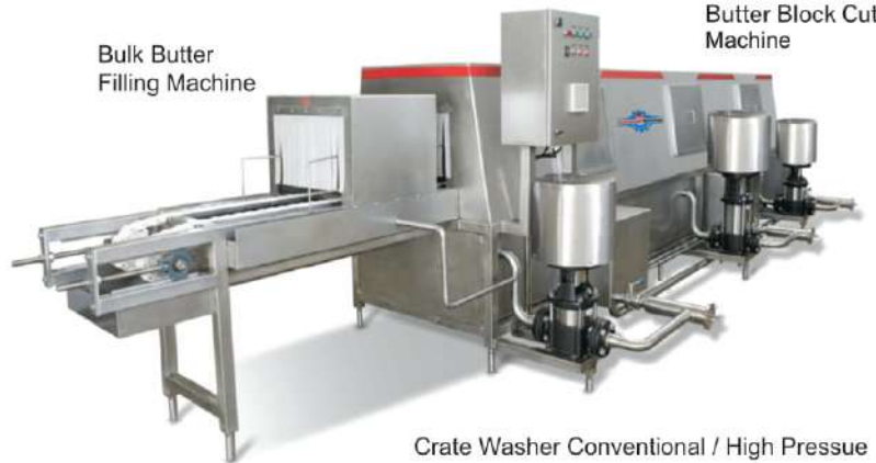
Crate Washer Conventional / High Pressure