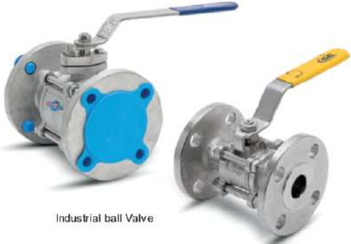
Industrial ball Valve